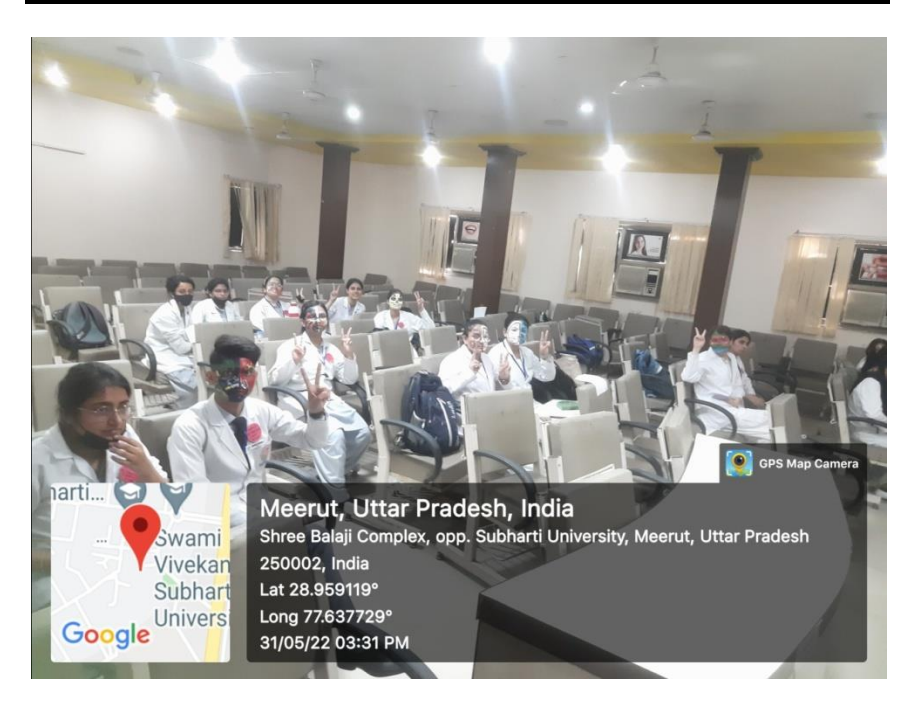
Face Painting Competition