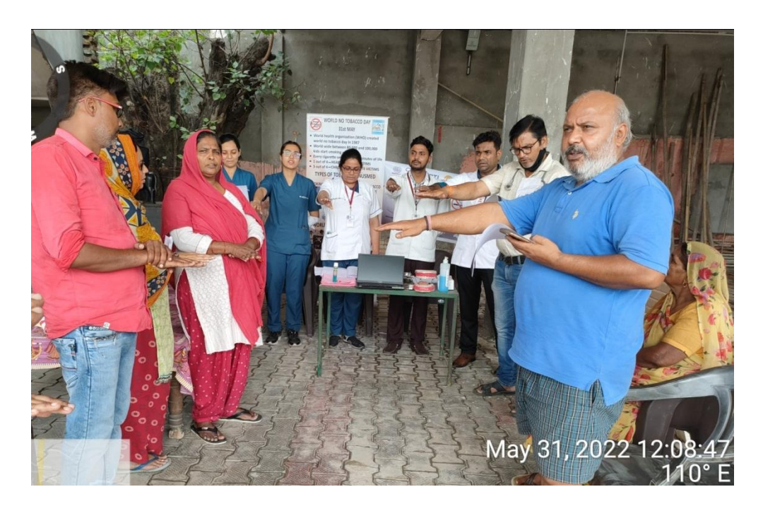
Oath taken by the camp patients for Quitting the tobacco