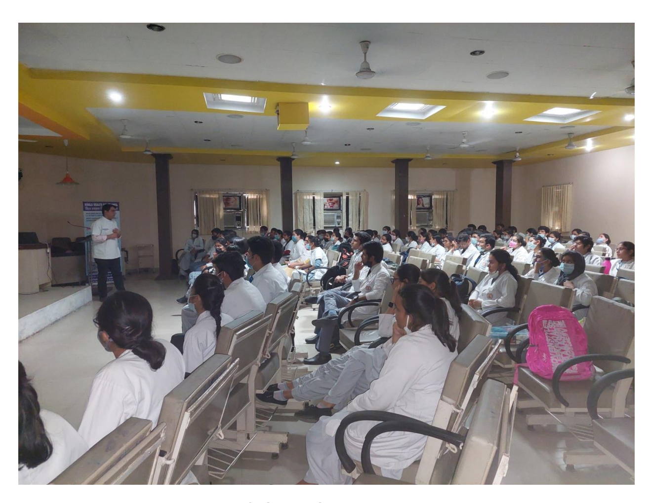
Quiz on Diet & Health