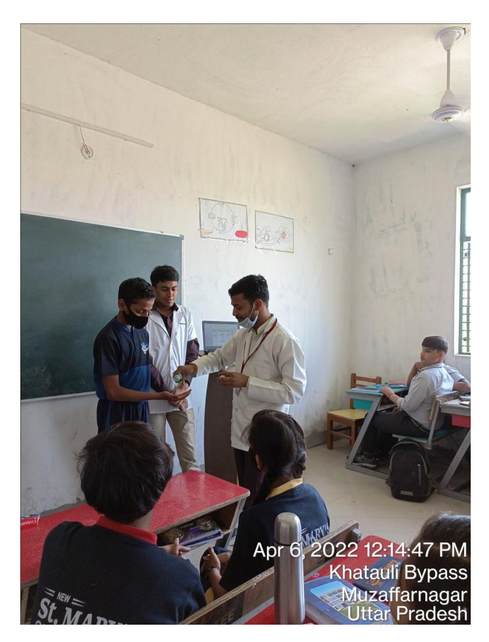
Lecture on Diet & Health